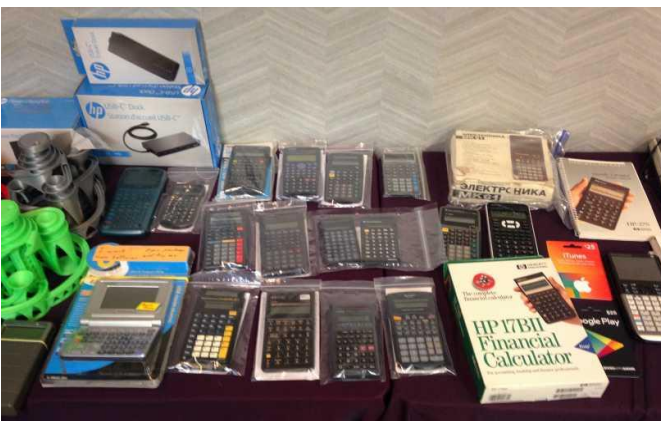
Fig. 7 – Lots of HP calculators.