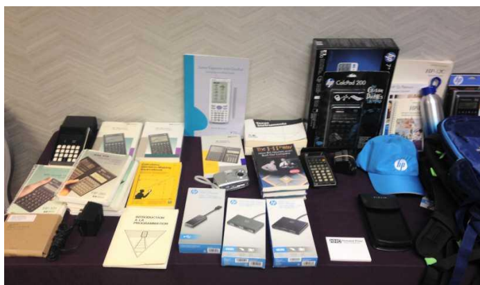
Fig. 4 – Calculator manuals and interfaces.

Bob Prosperi donated a digital nametag that Joseph and I wore at the Conference. If the winner wants a copy of an extensive article I wrote about the display, email me to request a copy. The Chinese instructions need to be additionally explained. Fig. 4 to Fig. 7 are a typical sampling of the four tables of door prizes.