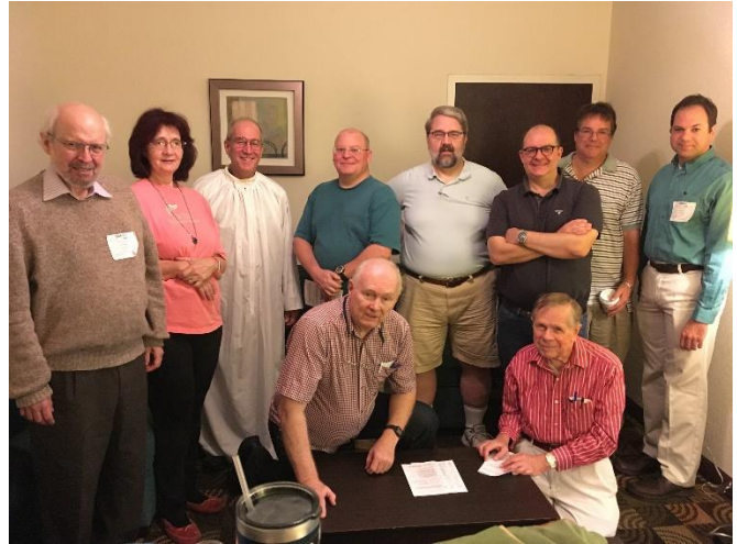
Fig. 8 - HHC 2017 Attendees Special Sunday Mass.