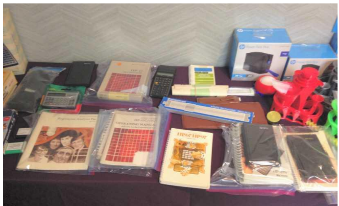
Fig. 6 – HP manuals, slide rules, 3D printed demos.