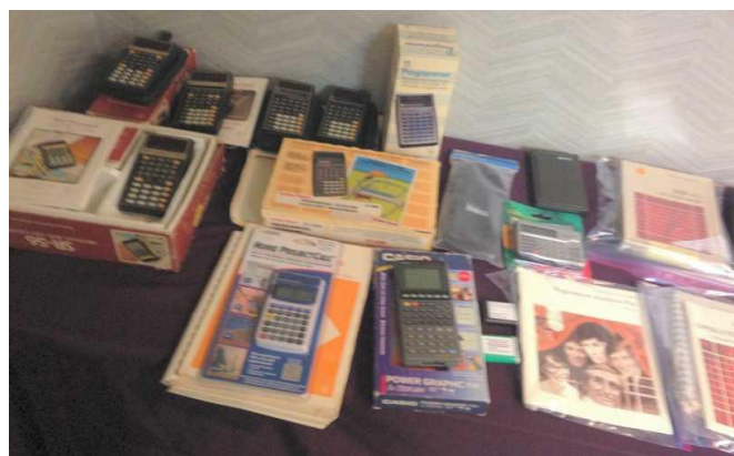
Fig. 5 – Assorted calculators, TI, Casio, and HP.