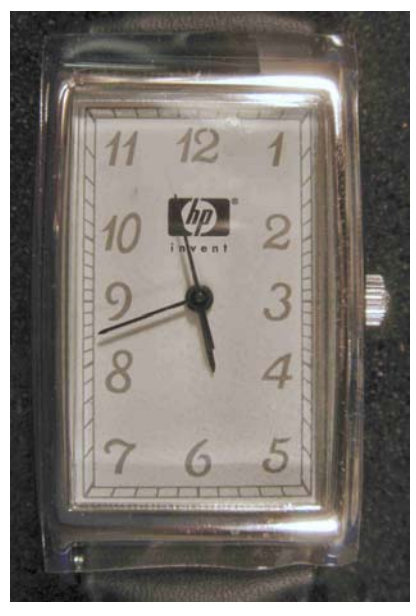
Fig. 5 - HP conventional watch face close up.