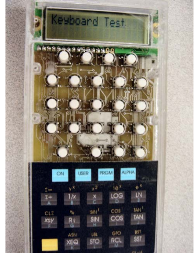
Fig 3 — Make your own keyboard and slide it on.