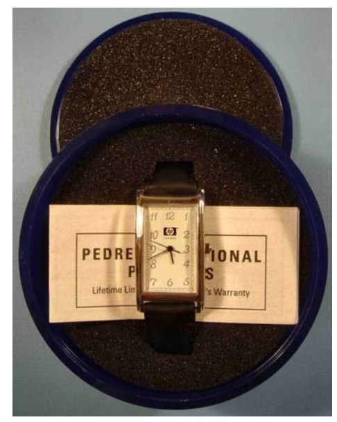
Fig. 4 - HP watch in round dark blue plastic case.

See photos at the right for the details.